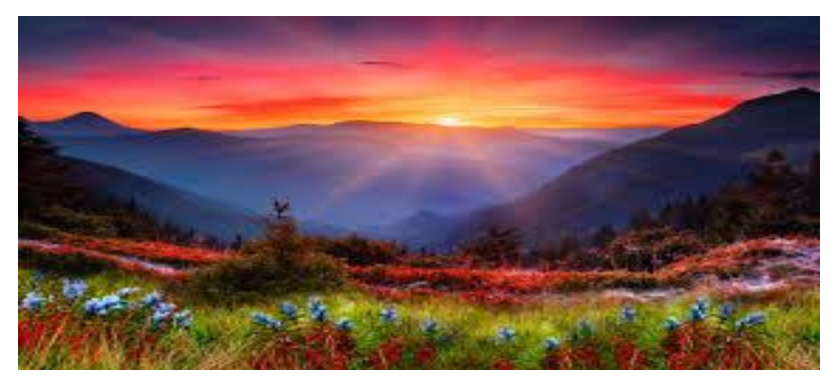
Senior Sunset Today

<u>Student Attendance</u> - If you need to call Attendance to clear an absence or have your student released for an appointment, please call your Attendance person directly using the information below: